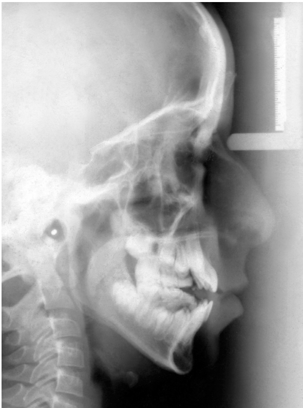
Figure 3. Initial cephalometric x-ray, taken in 1989.

cementum to heal and prevents further resorption. 24,25