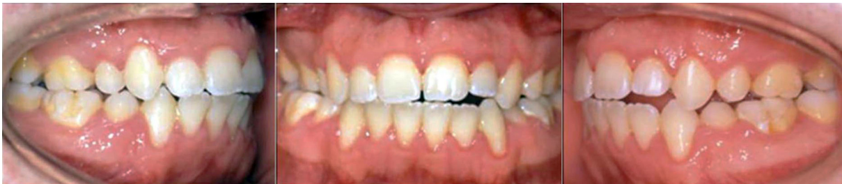
Figure 10. Intraoral photographs taken after last debonding in 2001.

Orthodontic treatment-related risk factors include a prolonged treatment time, the direction of force and tooth movement, and the type of force application. 2 In this study, the potential patient-related risk factors of ARR were observed to be an allergic constitution and the severity of malocclusion.