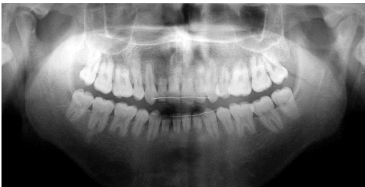
Figure 11. Panoramic x-ray, taken in 2001.