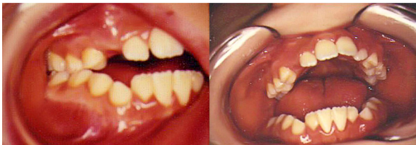
Figure 1. Initial intraoral photographs, taken in 1989.

Minimises further root resorption. 2 Levander et al 22 showed that the amount of root resorption is significantly less in patients who are treated with such pauses than in those treated without an interruption. Acar et al 23 also indicated that the application of discontinuous force results in less root resorption than does the application of continuous force. This situation can be explained by the fact that a pause in the force allows the resorbed