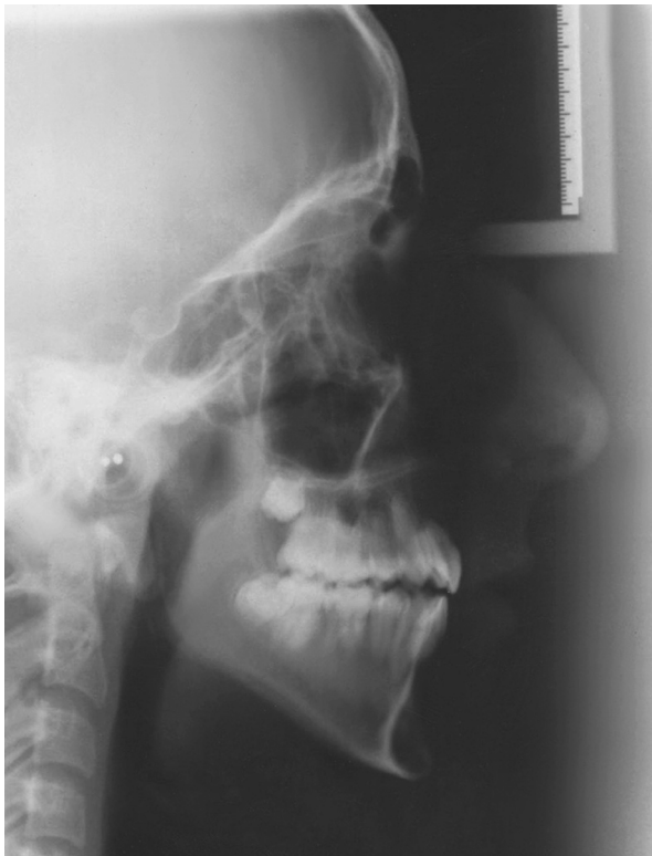
Figure 9. Post-treatment cephalometric x-ray, taken in 1994.

The patient came back to the hospital approximately one year later with a degree of open bite