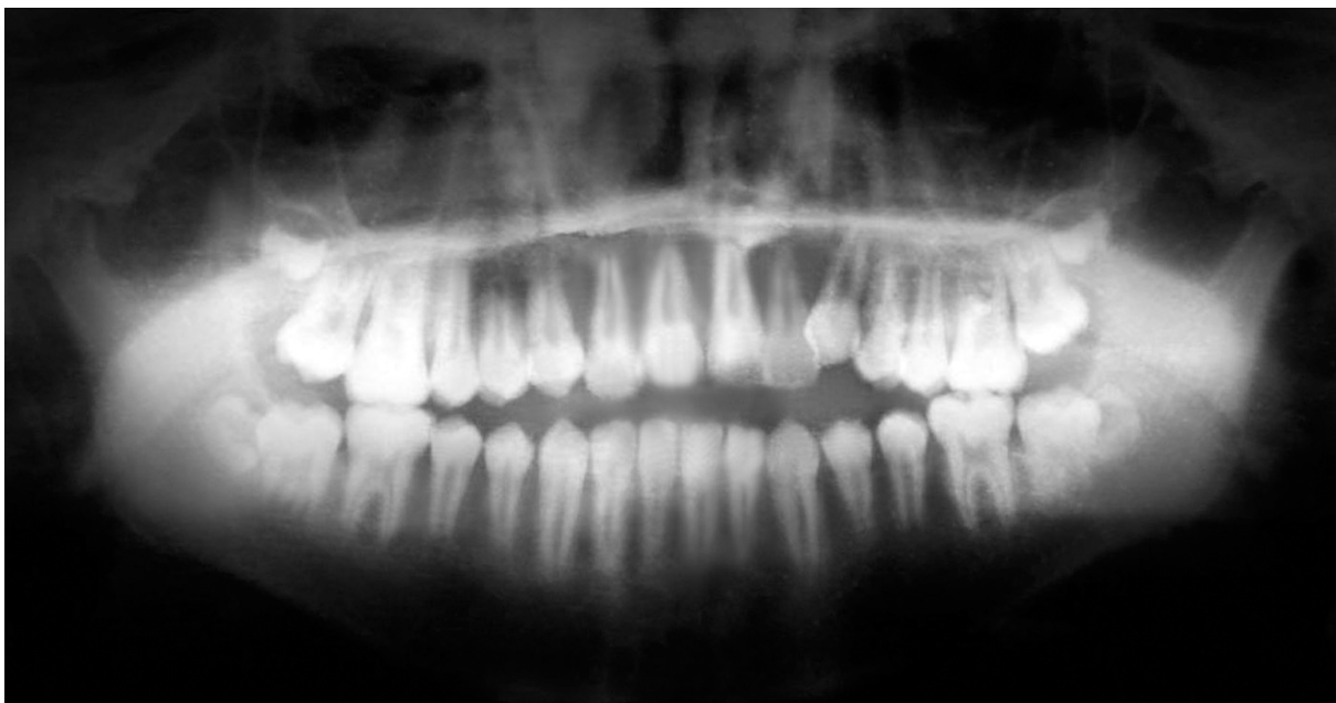
Figure 5. Panoramic x-ray taken before fixed appliance treatment in 1991.