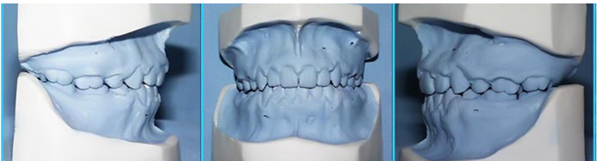
Figure 7. Post-treatment dental casts, obtained in 1994.

The fixed appliance therapy was planned along with four first premolar extractions in 1991. Treatment with straight wire appliances was initiated, followed by rapid maxillary expansion and premolar extractions. Treatment was completed with a good occlusion and aesthetics (Figures 7-9). However, there was some degree of ARR in almost every tooth, clearly visible on the panoramic radiograph from 1994 (Figure 8). The teeth most affected by severe ARR were the upper and lower incisors and the upper first molars.