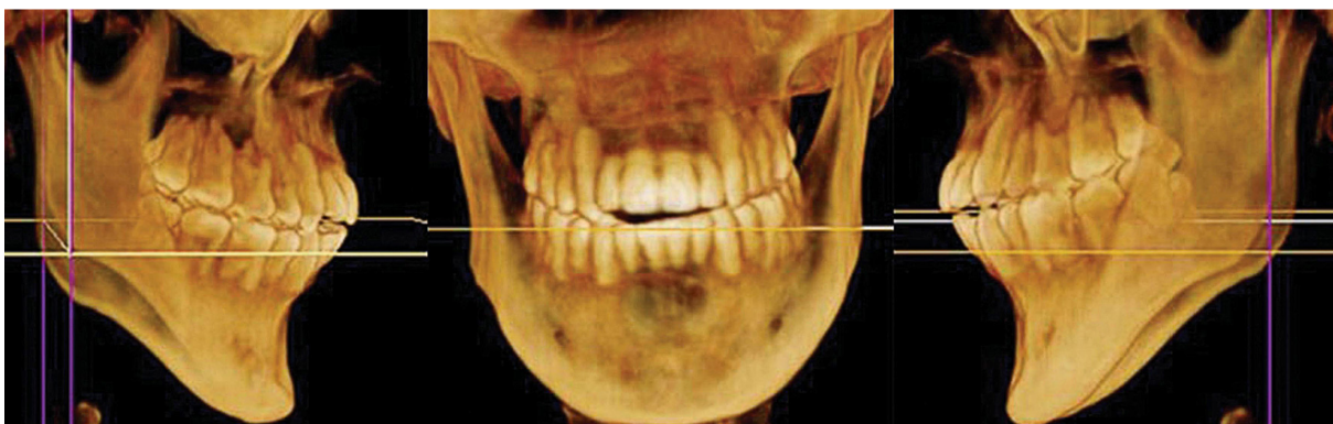
Figure 14. Anterior and lateral CBCT images, taken in 2010.

Field et al 32 were recently able to fabricate a computer model of strain distribution in a multi-tooth model. The authors suggested that the de-