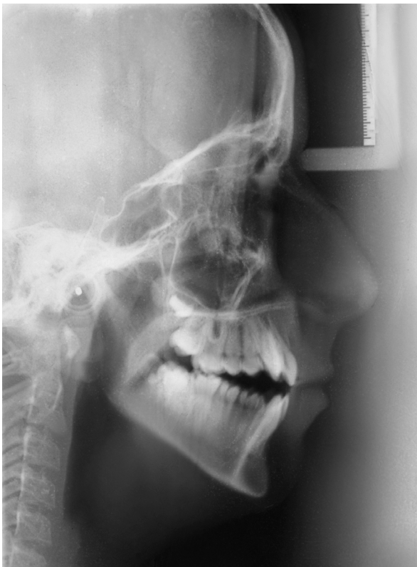
Figure 6. Cephalometric x-ray taken before fixed appliance treatment in 1991.

• A family history of allergies and asthma After evaluation of the patient (Figures 1-3), Frankel IV appliance therapy was immediately initiated; this course of treatment began in 1989. After two years, the patient still had an anterior and bilateral open bite with occlusal contacts solely on the molars (Figures 4-6). As seen on the panoramic x-ray, the transition from mixed dentition to permanent dentition was completed in 1991 (Figure 5). However the apexification of some teeth was still progressing.