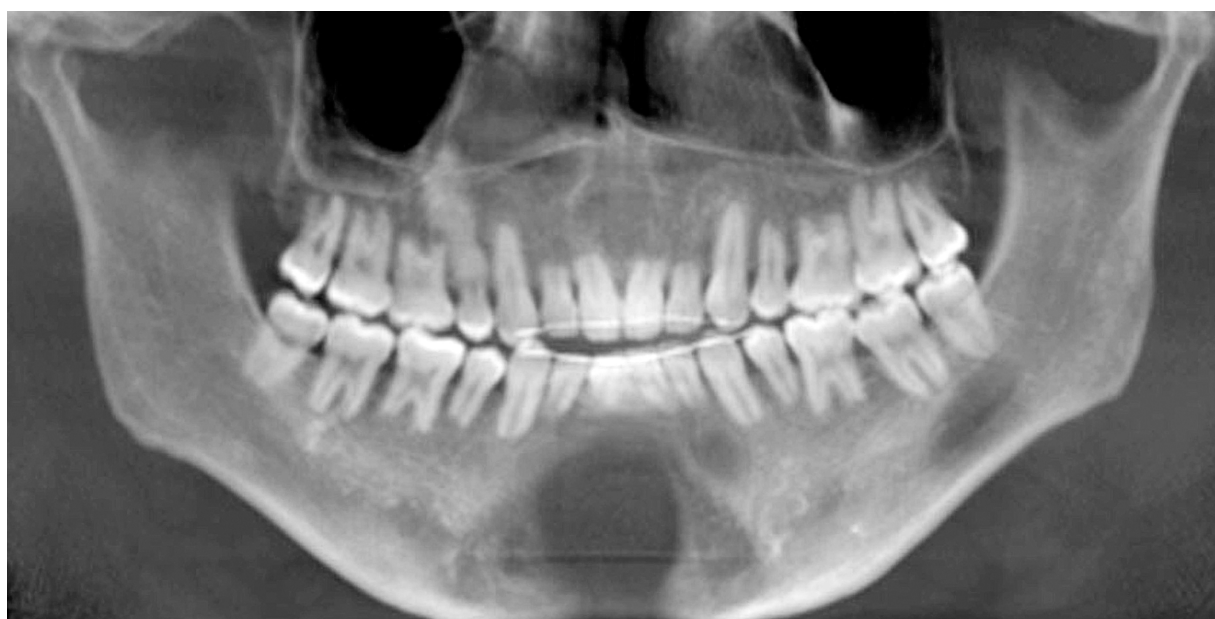
Figure 13. Last panoramic x-ray, taken in 2010, the patient was 31 years old.