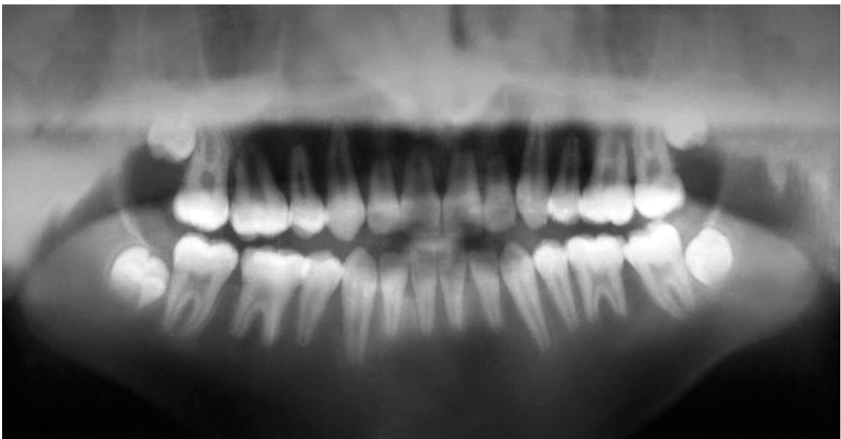
Figure 8. Post-treatment panoramic x-ray, taken in 1994. Clearly visible ARR.