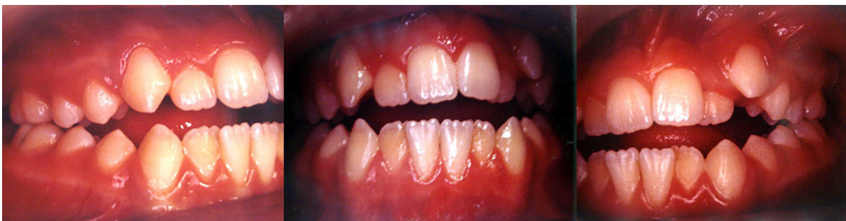
Figure 4. Intraoral photographs after Frankel IV therapy in 1991.